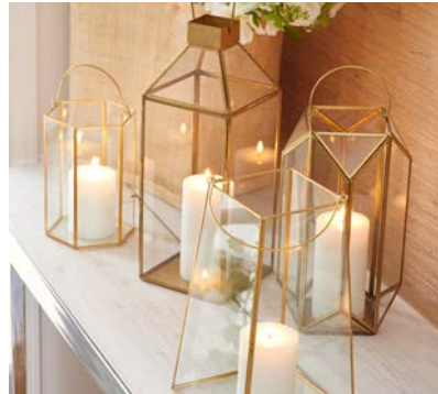
Gold Lantern Cluster

3 Lanterns Ranging in Size $30.00 per table