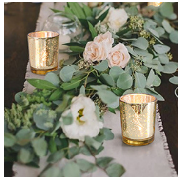
Mercury Glass Votives