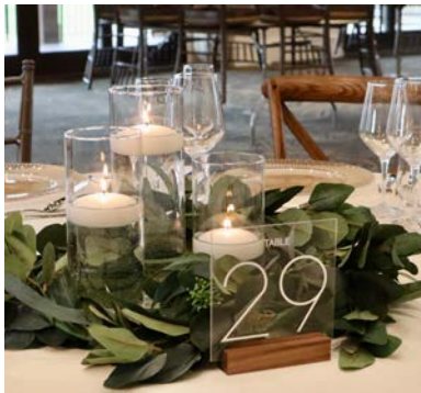
Floating Candle Trio