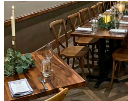
Add Faux Eucalyptus Garland to any Centerpiece