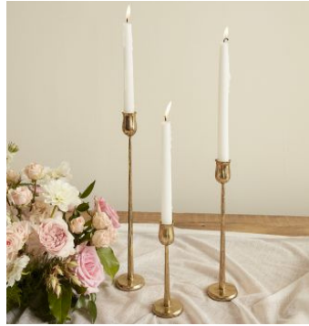
Taper Candlestick Trio