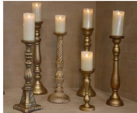
Pillar Candle Trio