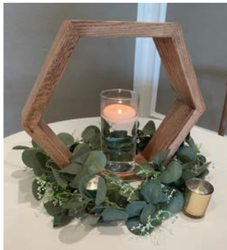
Hexagon & Candle