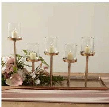
Epiphany Candle Stand